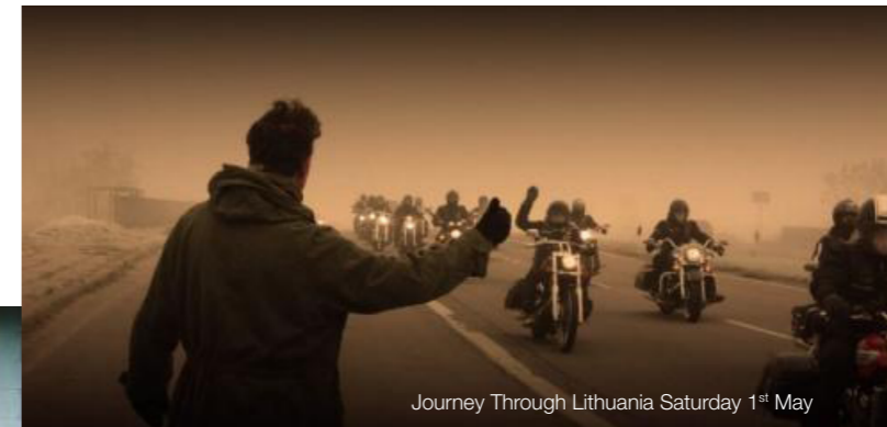
Journey Through Lithuania Saturday 1st May

5pm Shorts 4 SHADOWS LULLABY KIDNEY WOOD LONELY KATHERINE THE PATIENT