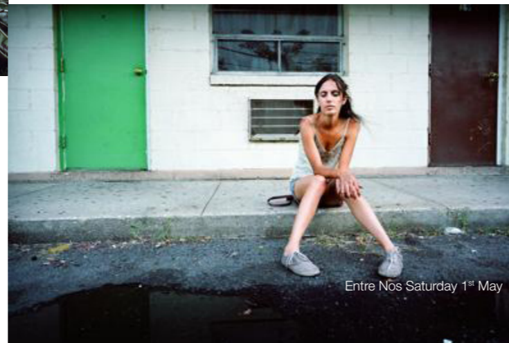
Entre Nos Saturday 1st May